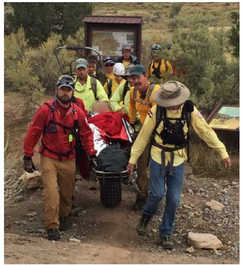
Just because Chino Hills State Park may not have high mountains or seemingly endless wilderness terrain, does not mean the Park is immune to search and rescue efforts. Read More (Scroll Down)