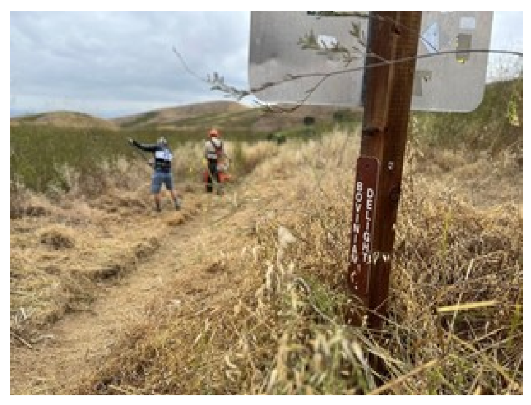
Anyone visiting the Chino Hills State Park in the spring will know the challenges presented by the incredible growth of introduced plants: especially yellow mustard and thistle. Read More (Scroll Down)